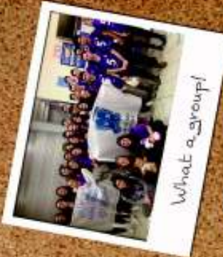
What a group!

Upon receipt of your registration form we will send you full details of the online application process. If your child has any additional needs then please contact Bnei Akiva so we can discuss the possible provisions and feasibility.