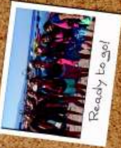
Ready to go!