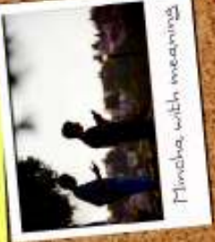
Mincha with meaning