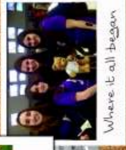
Where it all began