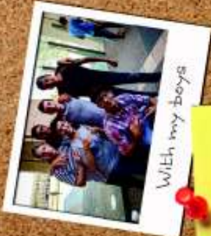
With my boys

The safety, security and wellbeing of the participants is, and always has been, our primary concern. Bnei Akiva Israel Machane is planned according to the security directives of the relevant security authorities in Israel, who check all the itineraries regularly and advise on changes which need to be made.