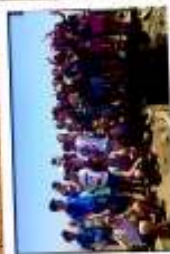
On top of Masada.