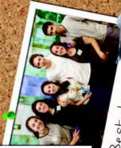
Best day everrrr!