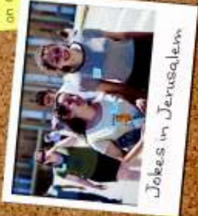
Jokes in Jerusalem

With years of experience running Israel Machane, you can trust us to provide balanced programmes deeply rooted in the values of Eretz Yisrael, Am Yisrael, and Torat Yisrael.