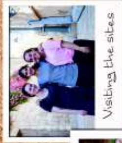
Visiting the sites