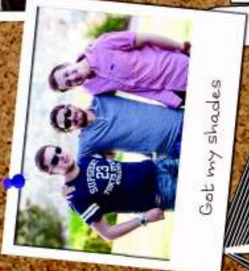
Got my shades