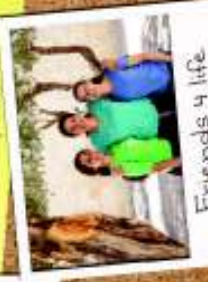
Friends 4 life

Each group has its own itinerary developed by their Madrichim. There are 4 Madrichim to a group. English and Israeli, who serve as role models and develop meaningful connections with each participant.